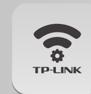
TP-LINK Tether App