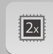
Dual Core 1 GHz CPU