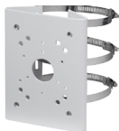
PFA150 Pole mount