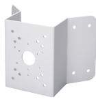
PFA151 Corner mount