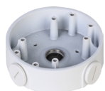
PFA139 Junction box