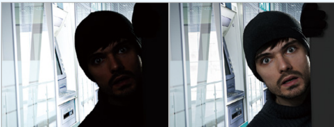
Without WDR Pro