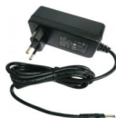
DC12V/3A Power Adapter