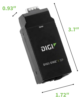
DigiOne® SP - FRONT

For a full list of accessories, visit www.digi.com