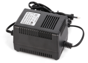
AC24V/3A Power Adapter