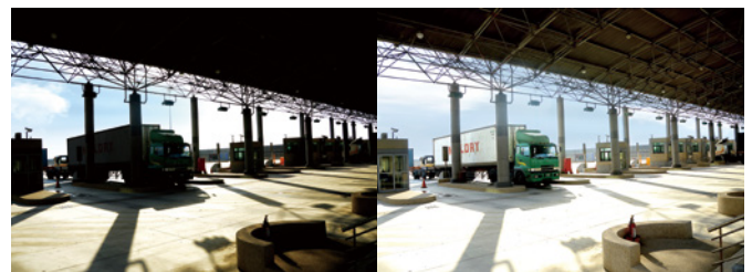
Without WDR Pro