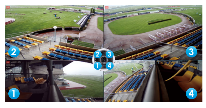
Multiple sensors, Adjustable views