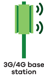
3G/4G base station