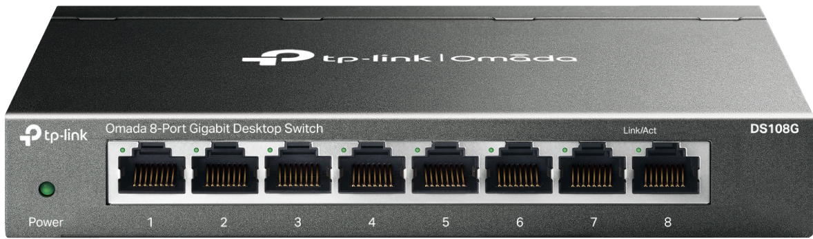
8 × Gigabit RJ45 Ports